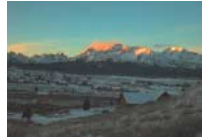
Sawtooth Mountains, Stanley, Idaho November 27, 2007

“This ‘Thank You’ is intended to go to all who had a part in producing “Hymns Of Thanksgiving” as well as all those participating in the choir and orchestra. I know of no other way to say thanks to so many for a wonderful evening of great music.”